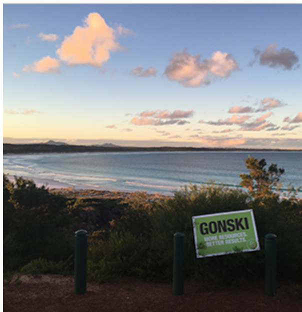
Taking the Gonski fight to Bremer Bay