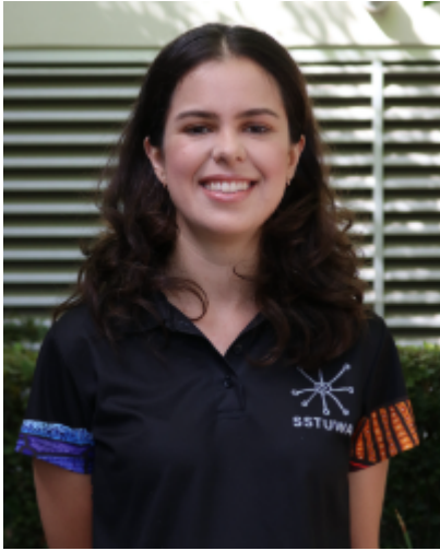
By Chloe Hosking Growth Team Coordinator

Finally, and most importantly, make sure you submit your application at least 28 days before your provisional registration expires to allow time for processing.