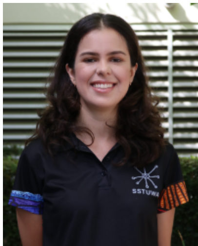
By Chloe Hosking Growth Team coordinator

One last thing: make sure you submit your application at least 28 days before your provisional registration runs out, so that you leave adequate time for processing. Without valid registration, you cannot teach.